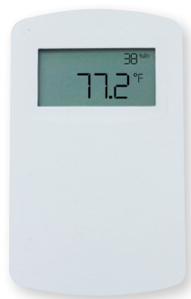
North American style